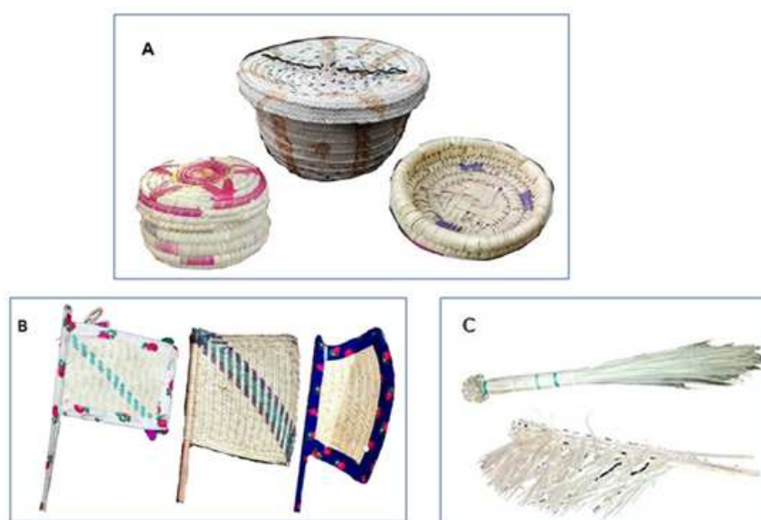
Figure 4. A) Different types of pots, B) Different types of manual fans, C) Two types of commonly used home brushes.

Traditional medicine has its significant participation in the Saudi Arabia's heritage and it is widely practiced [10], so difficulties facing these skills and different ways of improvement these skills and its people should be studied in the future, as these skills could have a good economical impact on the country economy, and biodiversity conservation.