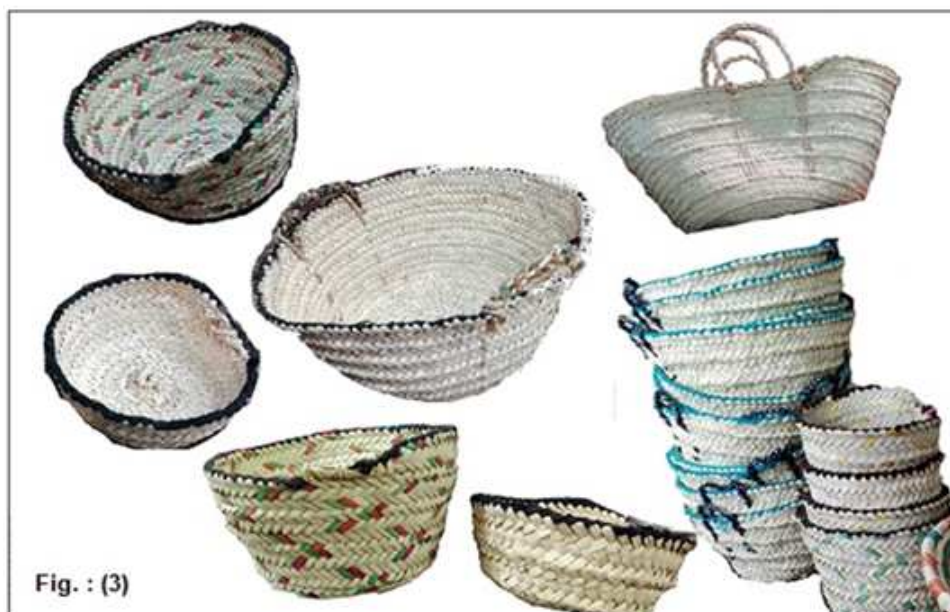
Figure 3. Different designs of baskets.