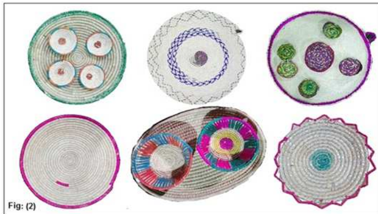
Figure 2. Different shapes of dishes.

The present study shows that majority of the traditional tools are mainly made of flaked of date palm trees. Most sellers ensured that only some of Al-haet district women out of the Ha'ilian women, who still interested in making these tools from palm flakes. Also, it was observed that the most common medicinal plants in these markets are Artemisia species and variety of local and imported spices.